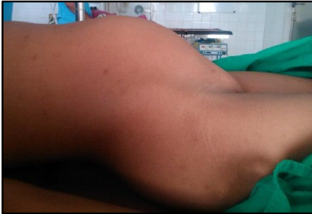
Figure 1: Fullness of abdomen

multiloculated cystic swelling measuring about 13x12 cm arising from right ovary (Figure 2). Tumor markers