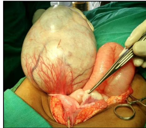
Figure 3: Intraoperative picture

was completely replaced by the mass (Figure 3). The left ovary was normal in size and shape for the age. The child underwent right salphingo-oophrectomy. Rest of the abdomen was normal. The child was started on feeds on post operative day 2. Postoperative recovery was uneventful and child was discharged on post operative day 5. Histopathology was suggestive of mucinous cystadenoma of right ovary. Child was on regular follow up since 1 year and recent follow up scan done one year after surgery shows normal left ovary.