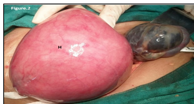
Figure 2: A huge hematometra with right serous cystadenoma